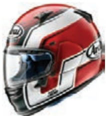
Bend Red 09-103x (H)

NOTE: Helmets below are not consistently stocked. Call for ETA if out of stock. Les casques dessous ne sont pas toujours en stock. Appelez pour (ETA) en cas de rupture de stock.