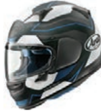
Sensation Blue Frost 09-102x (H)