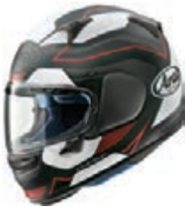
Sensation Red Frost 09-100x (H)