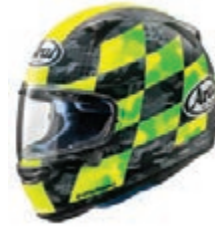
Patch FI. Yellow Frost 09-107x (H)