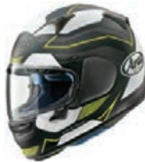
Sensation Yellow Frost 09-101x (H)