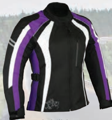
Purple / Black